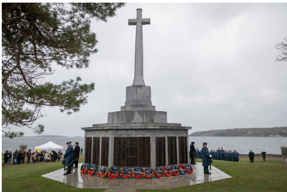
Attendees gathered at the Halifax Memorial in Point Pleasant Park on May 3 to mark 81 years since the end of the Battle of the Atlantic.