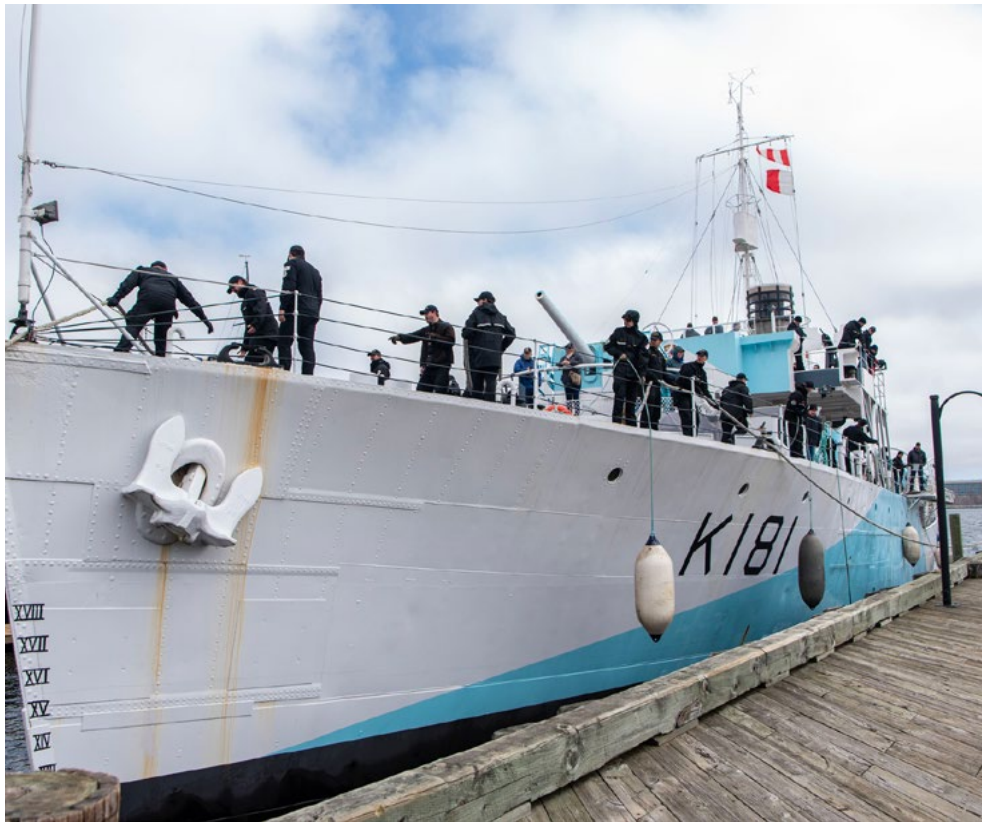
HMCS Sackville was recently moved to its waterfront berth at Sackville Landing ahead of its ceremonial re-commissioning.