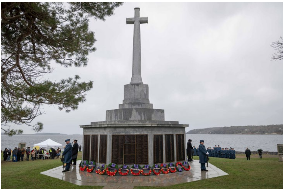
Attendees gathered at the Halifax Memorial in Point Pleasant Park on May 3 to mark 81 years since the end of the Battle of the Atlantic.