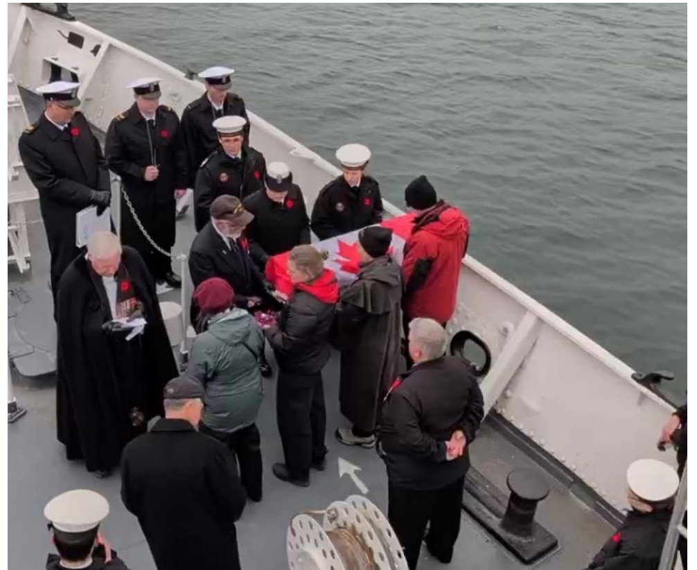
Committal of ashes aboard HMCS Sackville off Point Pleasant Park during Battle of the Atlantic commemorations on May 3.