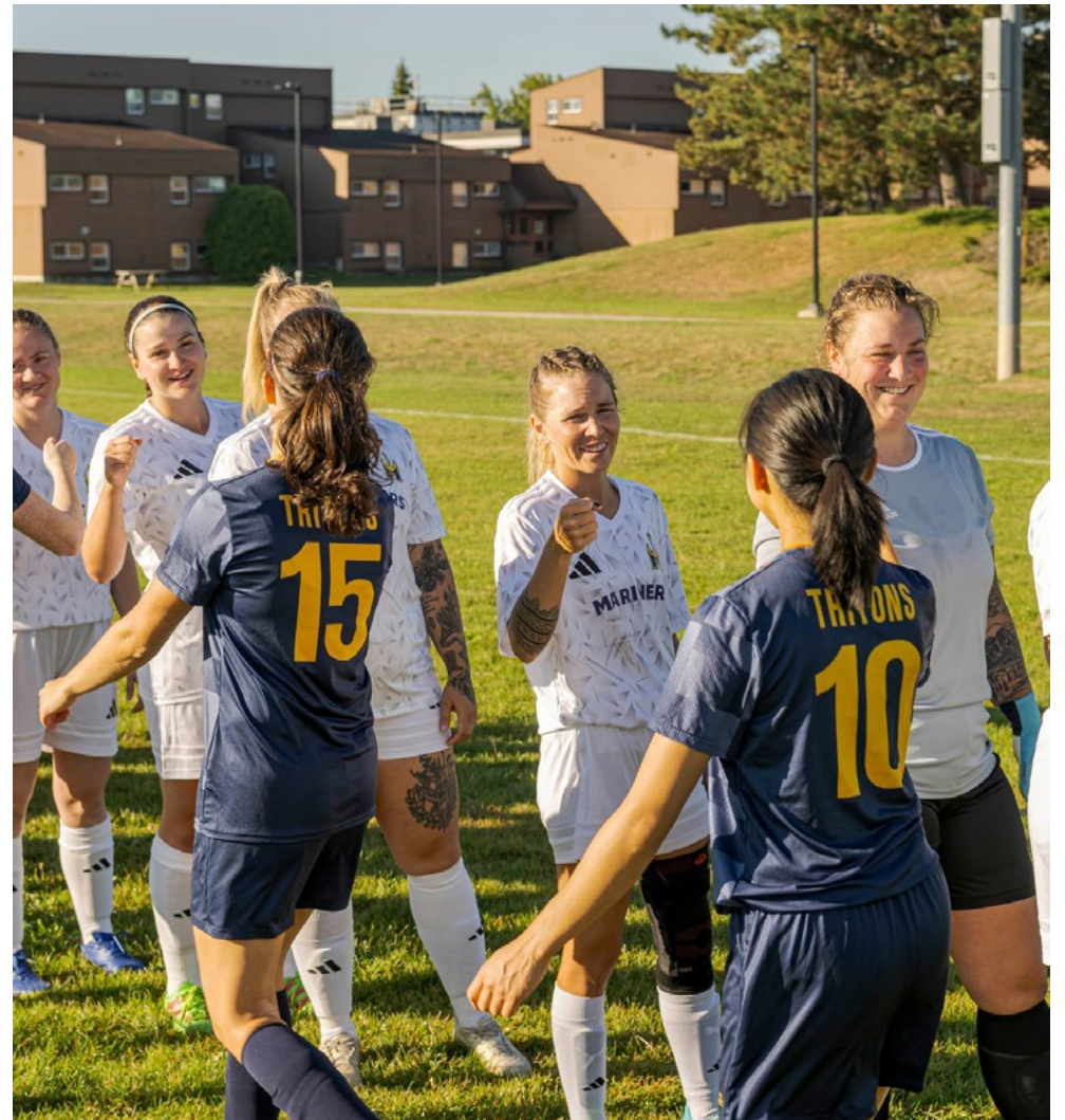
Applications for the 2026/2027 CAF Women in Sport Program are now being accepted.