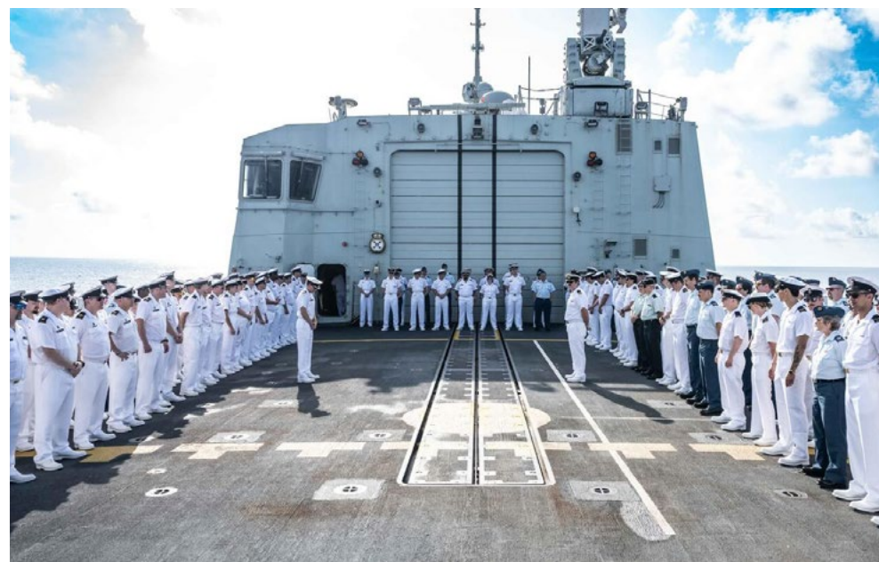
Additional Battle of the Atlantic commemorations across the RCN included a ceremony at sea aboard HMCS Charlottetown, currently deployed to Operation HORIZON in the Indo-Pacific.