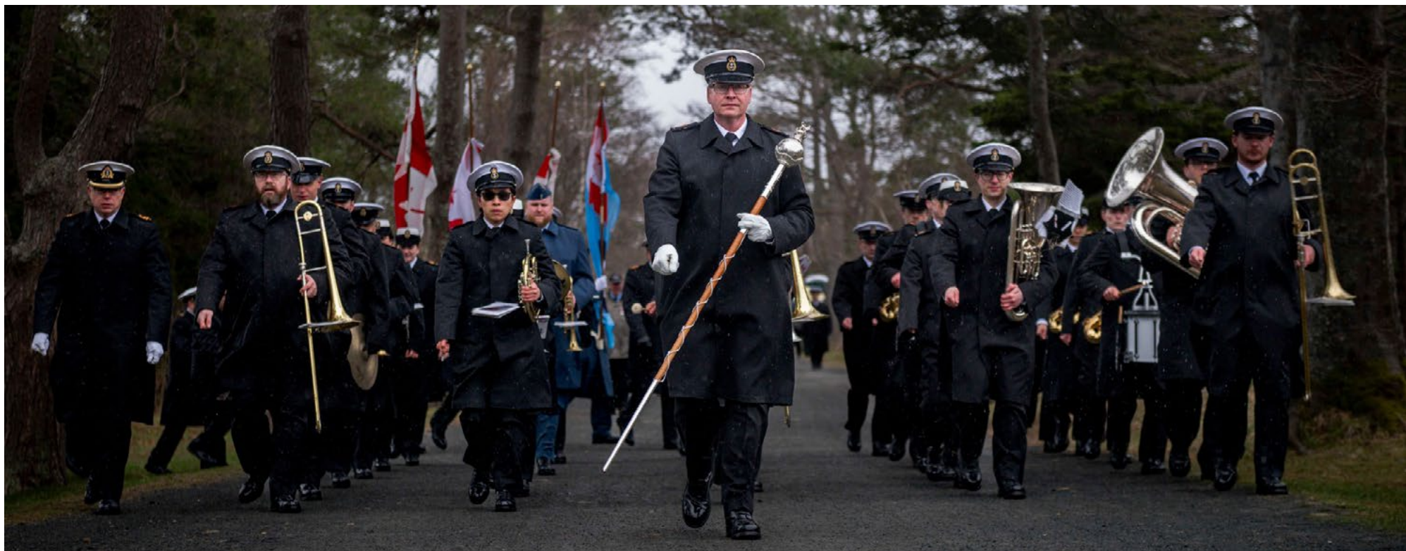
Members of the Stadacona Band of the Royal Canadian Navy march along Sailor's Memorial Way.