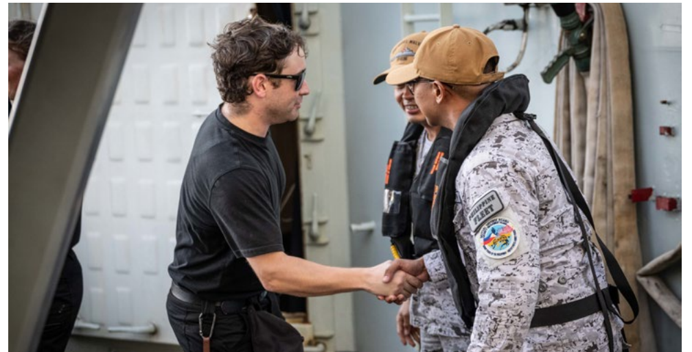
Members of the Philippine Navy were welcomed aboard HMCS Charlottetown for a personnel exchange in support of Exercise BALIKATAN 2026 on April 25.