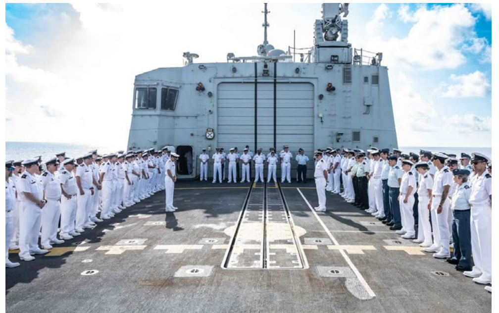
Additional Battle of the Atlantic commemorations across the RCN included a ceremony at sea aboard HMCS Charlottetown, currently deployed to Operation HORIZON in the Indo-Pacific.