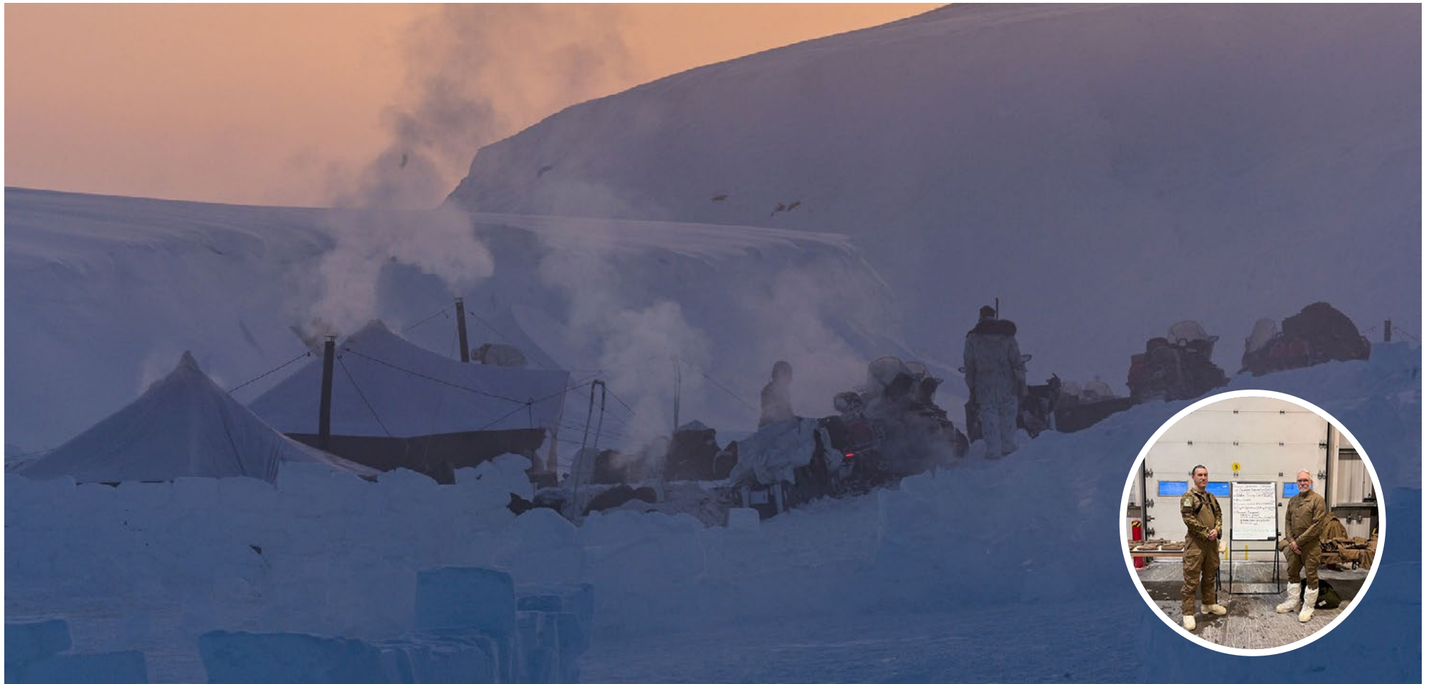
Canadian Forces School of Search and Rescue (CFSSAR) candidates work on shelter construction at Crystal City in Resolute Bay, NU on February 16.