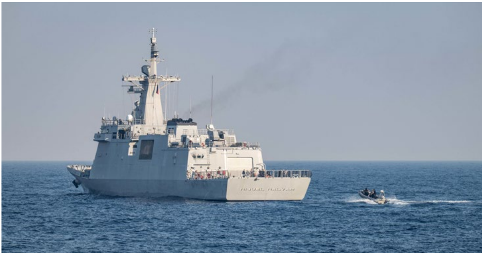
The Philippine ship BRP Miguel Malvar is photographed at sea from HMCS Charlottetown during Exercise BALIKATAN on April 27.