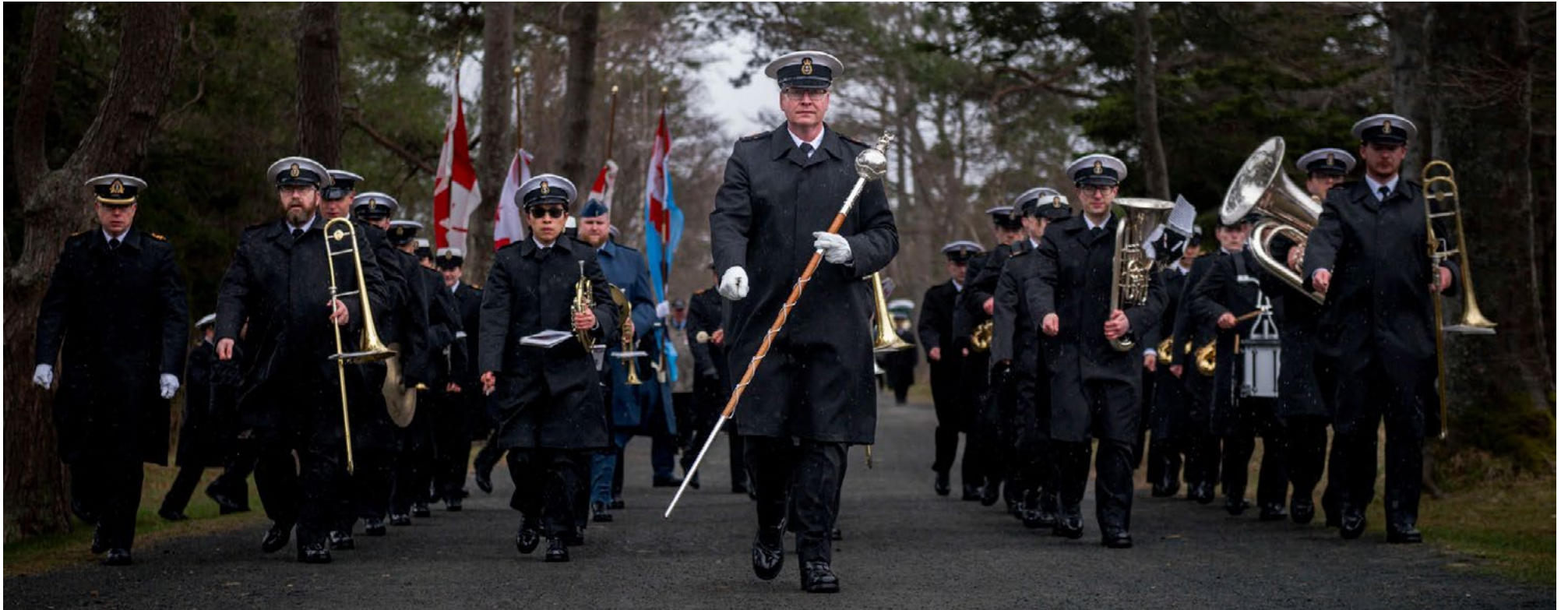
Members of the Stadacona Band of the Royal Canadian Navy march along Sailor's Memorial Way.