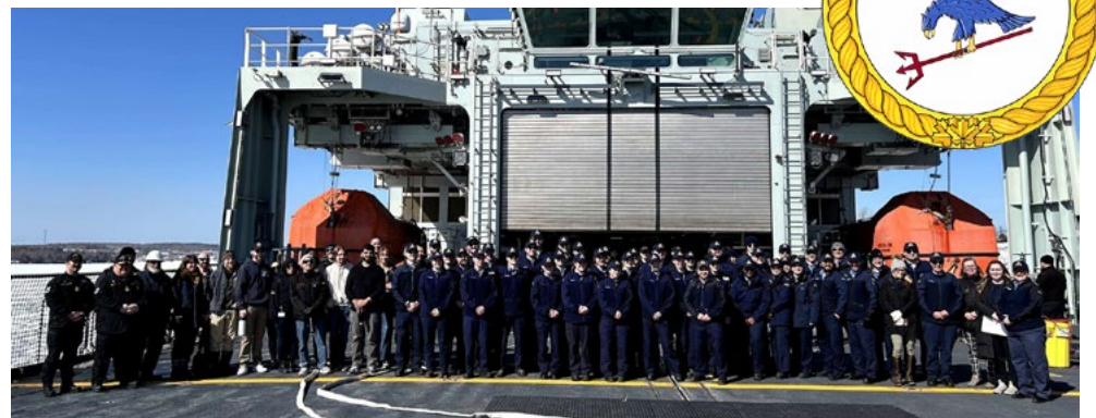
CANADIAN COAST GUARD