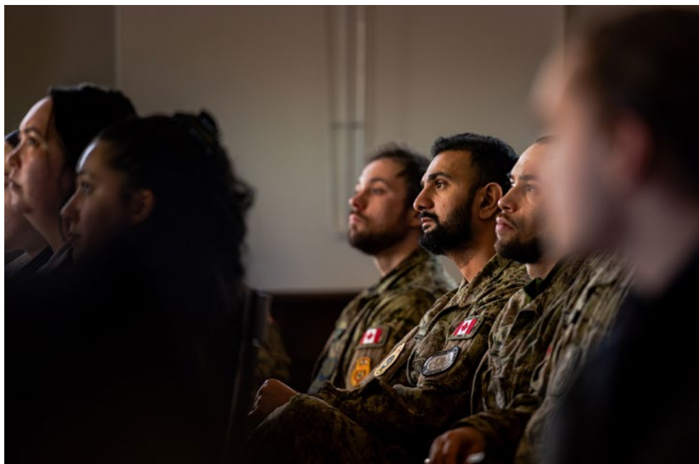
CAF members at Juno Tower during an IDERD event on March 25.