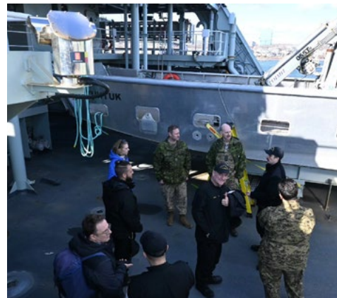
HMCS FRÉDÉRIC ROLETTE