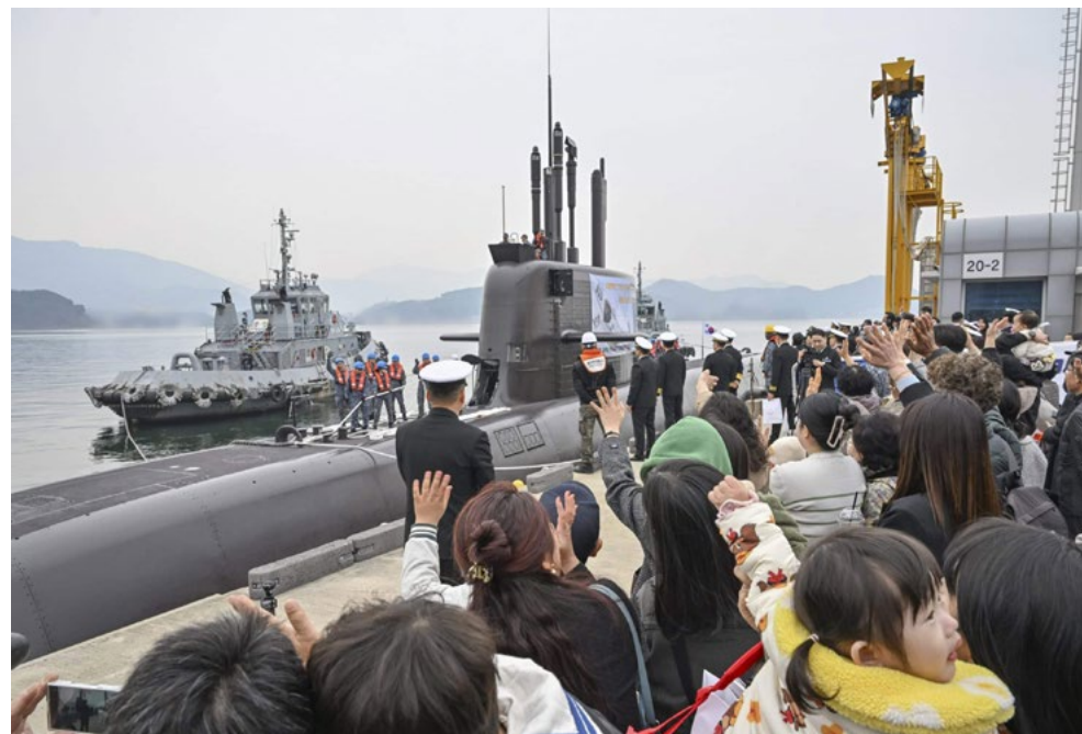
ROKS Dosan Ahn Chang-ho and ROKS Daejeon set sail from Jinhae Naval Base on March 25 to participate in naval exercises with the RCN in June.

Near the conclusion of the ROKN port visit, both ROKN and RCN assets will depart from Esquimalt Harbour to