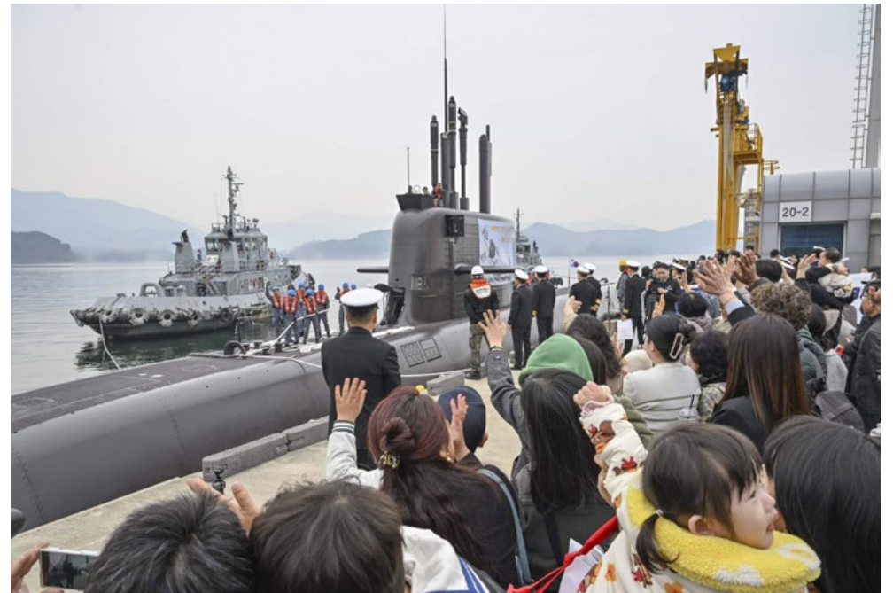
ROKS Dosan Ahn Chang-ho and ROKS Daejeon set sail from Jinhae Naval Base on March 25 to participate in naval exercises with the RCN in June.

Near the conclusion of the ROKN port visit, both ROKN and RCN assets will depart from Esquimalt Harbour to