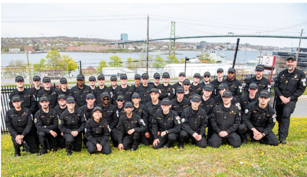
Naval Experience Program participants outside Tribute Tower in Halifax.

Plans are for the program to continue in the coming years.