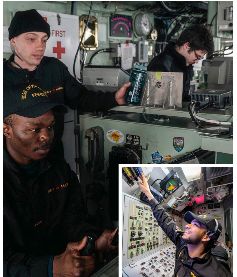
A recent Naval Fleet School (Atlantic) visit saw recruits get familiarized with the Submarine Trainer at CFB Halifax.