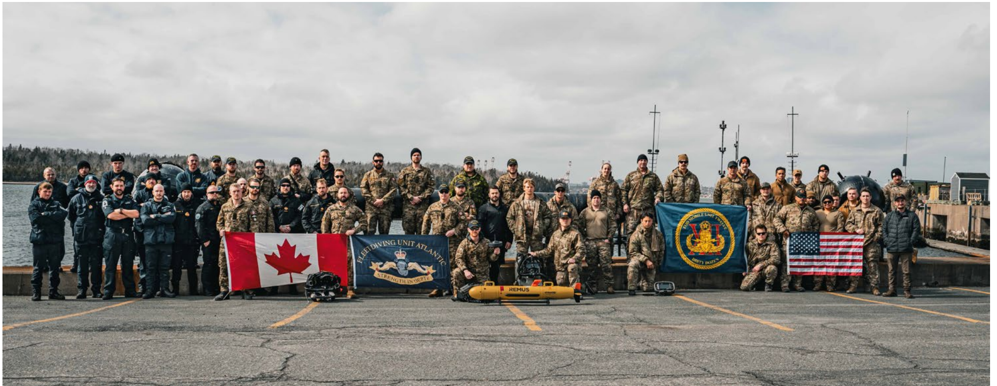
Members of Fleet Diving Unit (Atlantic) and U.S. Navy Explosive Ordnance Disposal Mobile Unit TWELVE together in Shearwater.