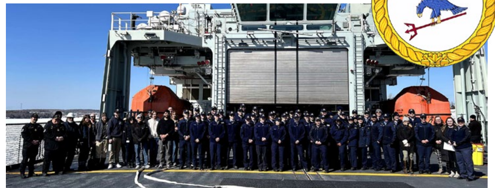
CANADIAN COAST GUARD