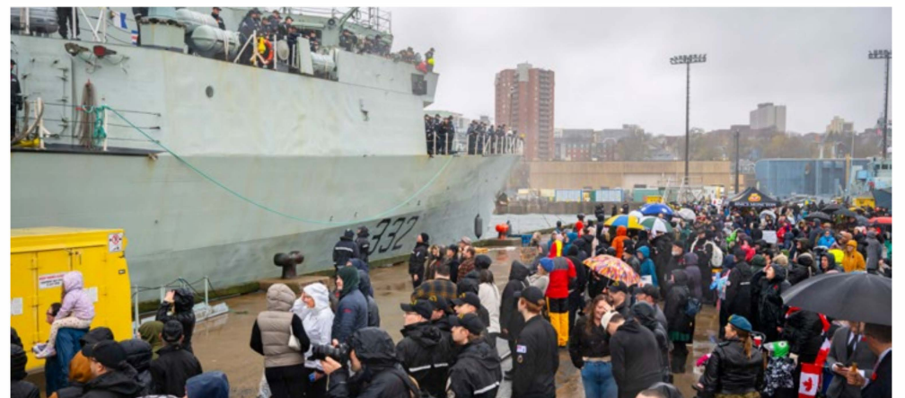
Stormy weather didn't stop a large crowd from gathering to welcome home the ship's company of HMCS Ville de Québec on October 10.