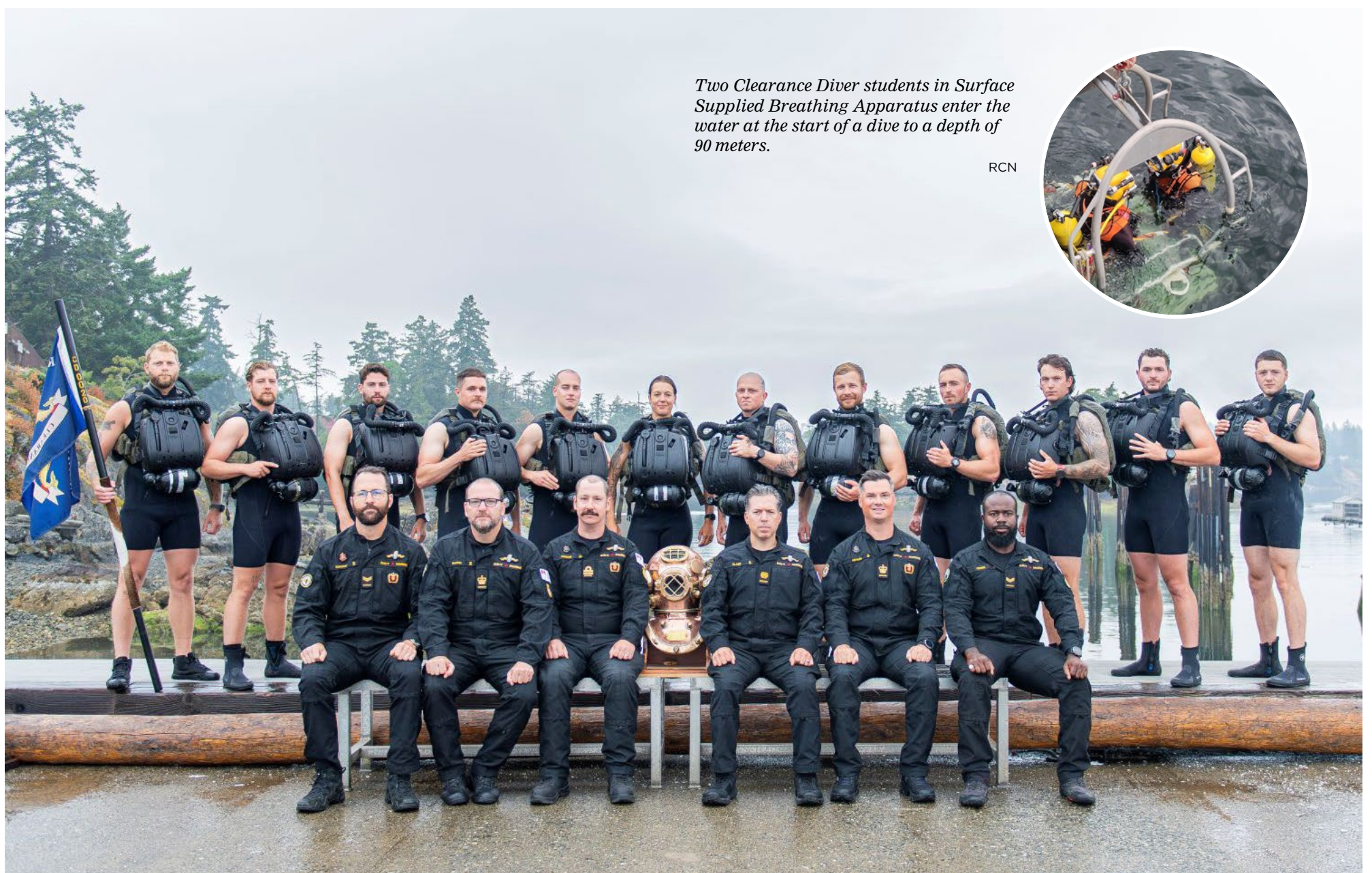
Two Clearance Diver students in Surface Supplied Breathing Apparatus enter the water at the start of a dive to a depth of 90 meters.