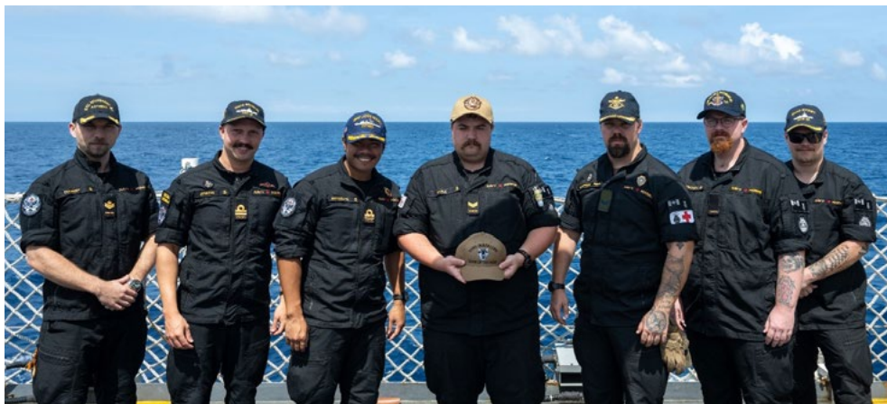
Winners of the ball cap silent auction show off their new caps. Note: The caps were worn solely for the photo and are not normally permitted for wear while in uniform.

Ready to book? Email our coordination team at Joseph.Abando@forces.gc.ca and Leah.Coughlin@forces.gc.ca .