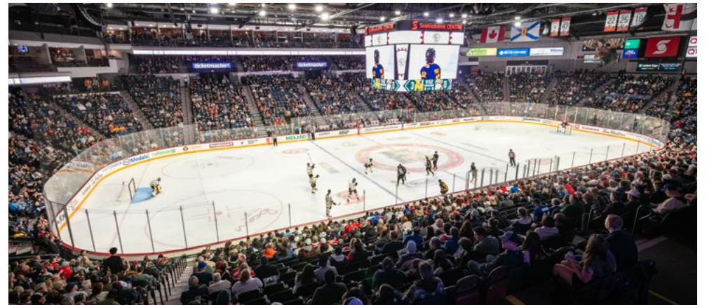
The on-ice action saw the Halifax Mooseheads take a 5-3 victory over the Cape Breton Screaming Eagles.