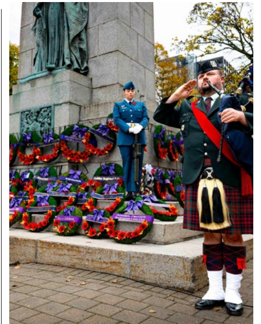
Wreaths laid at the Grand Parade Cenotaph during 2025 Remembrance Day ceremonies in Halifax.

Conflicts and unrest continue to rise across the globe, in case you haven't noticed. It's a fact we cannot ignore or wish away without confronting it with courage and resolve. I'm grateful that Canada continues to value both peace and preparedness. We now have a moral duty to teach future generations of Canadians that freedom and democracy come at a price, and that price is to always "Stand on guard for thee."