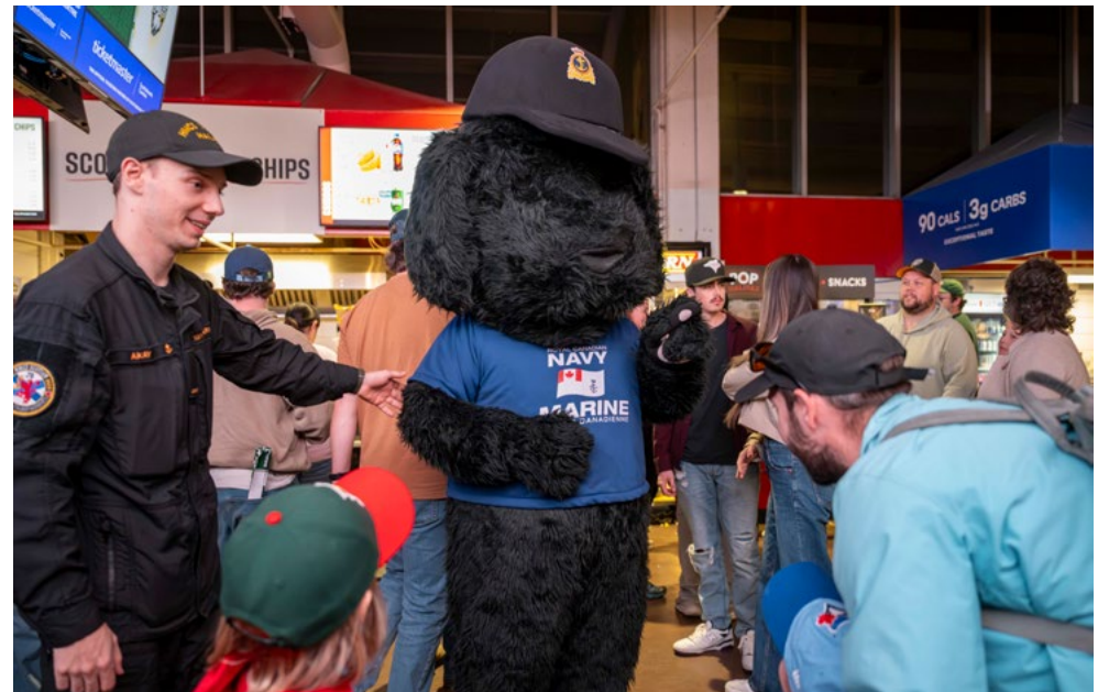
Sonar, the Royal Canadian Navy mascot, joined in on the fun.