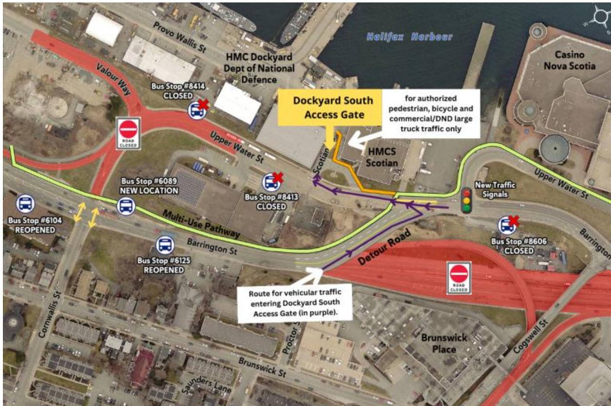
Figure 1. The south entrance to Valour Way (at Upper Water Street) is now closed to motor vehicle, bicycle and pedestrian traffic as of February 6, 2023 and will remain closed for a duration of approximately two years (see Figure 1). This closure allows for the construction of a new roundabout that will create a more efficient flow of traffic to/from the downtown core.