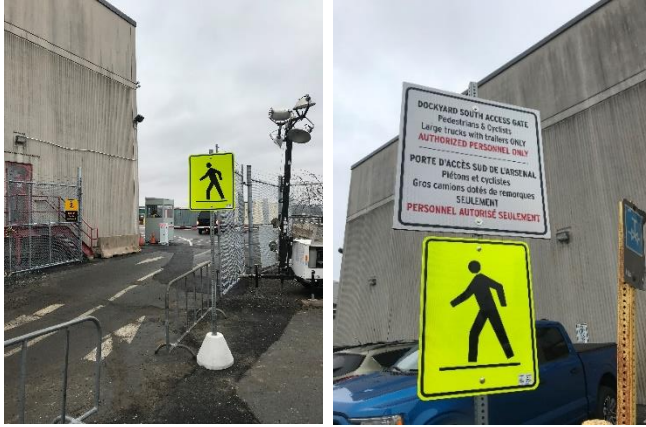
Figure 2. Dockyard South Access Gate opened on February 6, 2023 between HMCS Scotian and the Base Logistics HAZMAT building. This gate is for pedestrian, bicycle and large, commercial truck traffic only and will remain open for the duration of the Valour Way south closure.