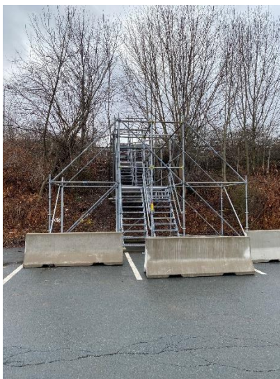
Figure 3. To support safe pedestrian transit between Barrington Street and HMC Dockyard during the Valour Way south closure, temporary stairs have been constructed between DND/HMC Dockyard non-operational zone parking area K and the Barrington Greenway.

DND will be constructing a permanent set of stairs in this same location in the future (construction date to be confirmed). At that time, public access to the area will be restricted to enable construction of the permanent stairs.