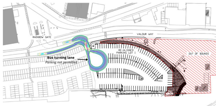
Figure 1: Newly re-aligned parking zone I reopened for Defence Team member use on July 25. Halifax Transit Route 11 (Dockyard) turning lane (blue) has been incorporated into the design of the new parking area. See 'Halifax Transit bus stop/route impacts' update below for more information.